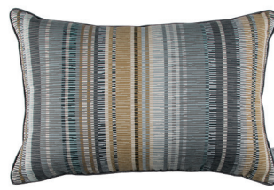
Chirripo Tamarind Face: Ottoman Weave Reverse: Linen Blend