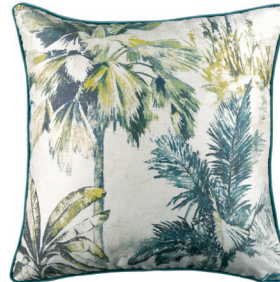
Japura Indian Green Face: Printed Cotton Blend Reverse: Velvet