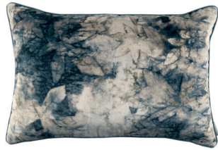
Sarita Tapestry Face: Printed Velvet Reverse: Linen Blend