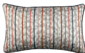
Makani Pomelo Face: Printed Embroidery Reverse: Linen Blend