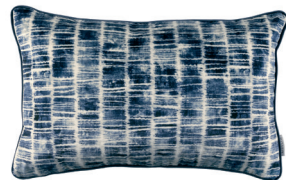
Kamakura Indigo Face: Printed Velvet Reverse: Linen Blend