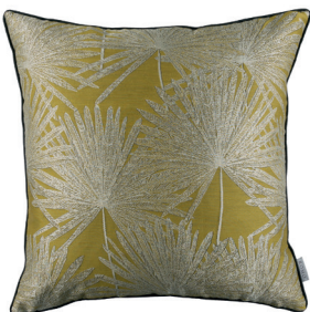
Pacaya Fenugreek Face: Jacquard Weave Reverse: Linen Blend