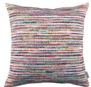
Miombo Peony Face: Decorative Weave Reverse: Linen Blend