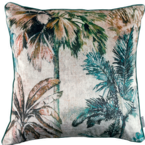
Japura Velvet Amazonite Face: Printed Velvet Reverse: Linen Blend