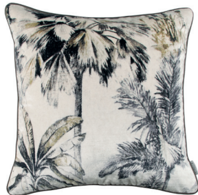
Japura Velvet Quartz Face: Printed Velvet Reverse: Linen Blend