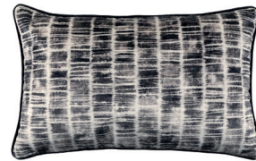
Kamakura Anthracite Face: Printed Velvet Reverse: Linen Blend