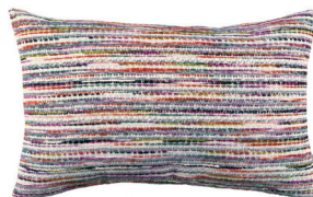
Miombo Peony Face: Decorative Weave Reverse: Linen Blend