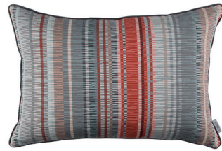
Chirripo Pomelo Face: Ottoman Weave Reverse: Linen Blend