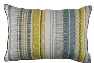
Chirripo Fenugreek Face: Ottoman Weave Reverse: Linen Blend