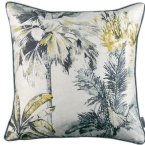
Japura Soleil Face: Printed Cotton Blend Reverse: Velvet