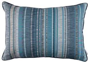
Chirripo Lake Face: Ottoman Weave Reverse: Linen Blend