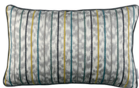
Makani Hummingbird Face: Printed Embroidery Reverse: Linen Blend