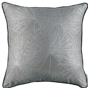
Pacaya Ash Face: Jacquard Weave Reverse: Linen Blend