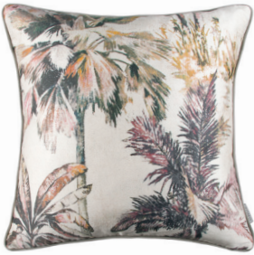
Japura Flamingo Face: Printed Cotton Blend Reverse: Velvet

Introducing Romo's latest range of cushions, featuring designs from the 2019 Japura collection. With an abundance of texture and colour, exotic scenes and unique designs form a bold and vivacious collection of cushions.