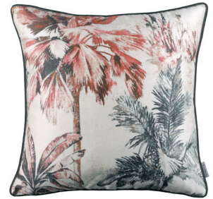
Japura Pomelo Face: Printed Cotton Blend Reverse: Velvet