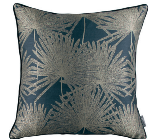
Pacaya Indigo Face: Jacquard Weave Reverse: Linen Blend