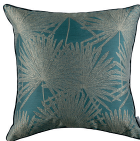
Pacaya Amazonite Face: Jacquard Weave Reverse: Linen Blend