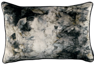
Sarita Shadow Face: Printed Velvet Reverse: Linen Blend