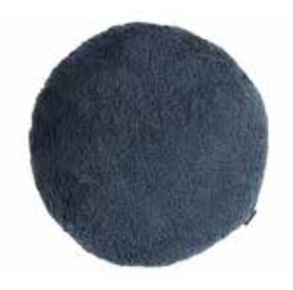
Stroke KDC5280/03 Kingfisher