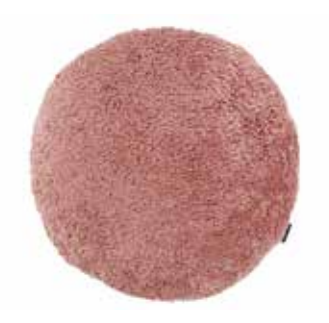
Stroke KDC5280/04 Vintage Rose