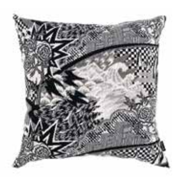
Graphic Fairytale Monochrome KDC5290/02

55cm x 40cm (21.5" x 15.75") Cover: Decorative Velvet