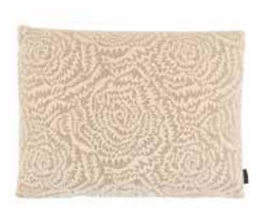
Jagged Roses Porcelain

55cm x 40cm (21.5" x 15.75") Cover: Decorative Velvet