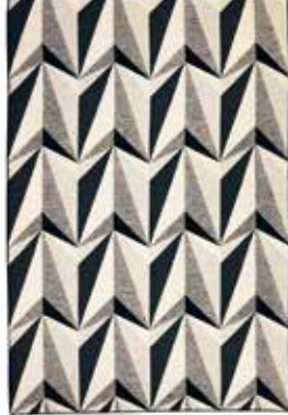
Origami Rockets Monochrome THK5294/01 140cm x 200cm (55" x 78.75") 140cm x 200cm (55" x 78.75") 140cm x 200cm (55" x 78.75")