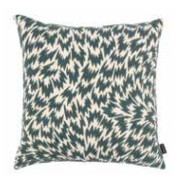
Flash Seafoam KDC5294/07

60cm x 60cm (23.5" x 23.5") Front: Decorative Weave Reverse: Stonewashed Linen