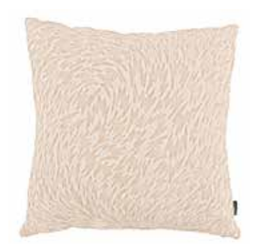
Flash Nude KDC5294/04

60cm x 60cm (23.5" x 23.5") Front: Decorative Weave Reverse: Stonewashed Linen