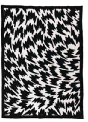
Flash Monochrome THK5293/01 140cm x 190cm (55" x 75")