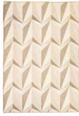
Origami Rockets Taupe THK5294/02