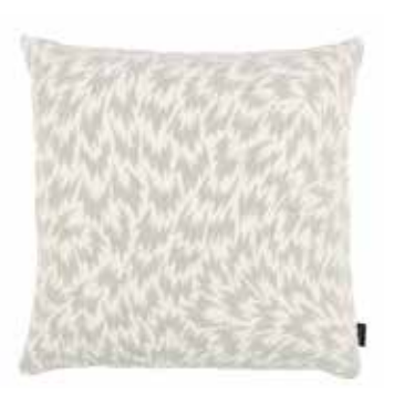
Flash Pistachio KDC5294/06

60cm x 60cm (23.5" x 23.5") Front: Decorative Weave Reverse: Stonewashed Linen