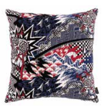
Graphic Fairytale Comic KDC5290/01

60cm x 60cm (23.5" x 23.5") Front: Decorative Weave Reverse: Stonewashed Linen