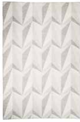
Origami Rockets Ash THK5294/03

A Kirkby Design x Eley Kishimoto original, this bold, eye-catching design forms a lively, woollen throw. Finished with a blanket stitch edge, the Origami Rockets Throw is a statement accessory.