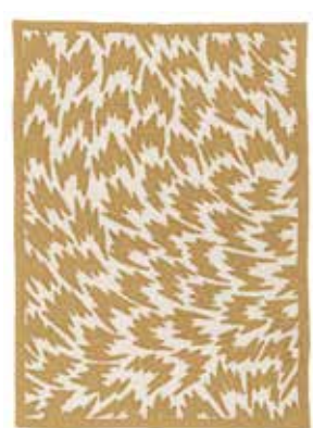
Flash Havana THK5293/02 140cm x 190cm (55" x 75")

Flash, a signature Eley Kishimoto design has been brought to life through a three-dimensional woollen throw. Using a specialist knitted technique, the Flash Throw is felted, giving it an exceptional softness.