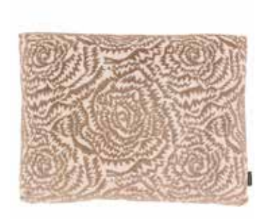
Jagged Roses Blossom KDC5289/04

55cm x 40cm (21.5" x 15.75") Cover: Decorative Velvet