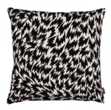
Flash Monochrome KDC5294/01

60cm x 60cm (23.5" x 23.5") Front: Decorative Weave Reverse: Stonewashed Linen