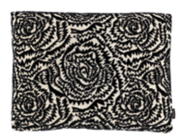
Jagged Roses Monochrome KDC5289/01

60cm x 60cm (23.5" x 23.5") Front: Épinglé Weave Reverse: Stonewashed Linen