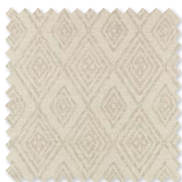
BERBER Jacquard Linen Weave 6 Colours