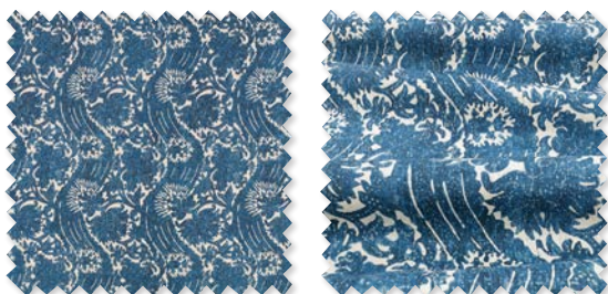
JAVA Printed Linen | 6 Colours 🚚 📏 📐