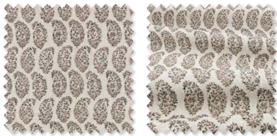
JAIPUR Printed Linen | 5 Colours 🚚 📏 📐

Within this offering, a love of period design is evident, but the mix of elements is complex, imaginative and richly eclectic.