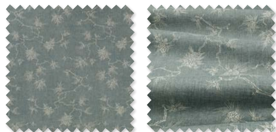
BONSAI Printed Linen | 6 Colours 🚚 📏 📐