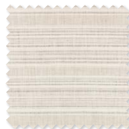
NOMAD Linen Weave 6 Colours