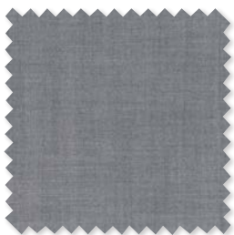
RIVA Jacquard Linen Weave 4 Colours

Full of rich texture, these understated designs are finely crafted yet relaxed, with inherent natural qualities.