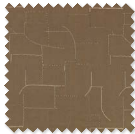
ATLAS Embroidered Linen | 5 Colours ✦