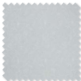
INDIENNE Linen Sheer Embroidery | 5 Colours ✦