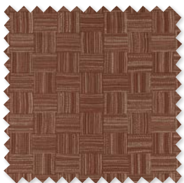
SANDTRACE Embroidered Linen | 4 Colours ✦