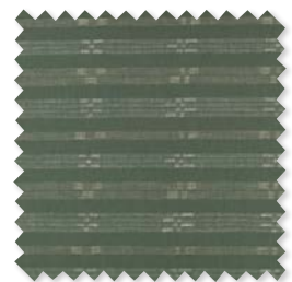
SHIMA Jacquard Linen Weave 6 Colours