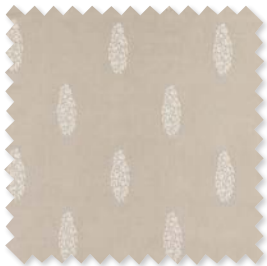
MUGHAL Embroidered Linen | 5 Colours ✦

A diverse mix of pattern has been expertly embroidered onto the finest linen. From a tranquil reinterpretation of a traditional crewel design to a design inspired by an 18th-century paisley document, these embroideries embody the fine balance between modern and traditionally handcrafted.