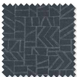
ODYSSEY Jacquard Linen Weave 5 Colours