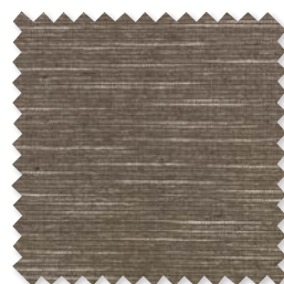
SOUK Linen Weave 4 Colours