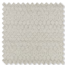
MAROC Jacquard Linen Weave 2 Colours