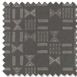
FOLK Embroidered Linen | 4 Colours ✦