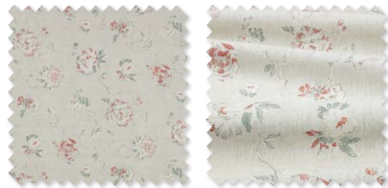
PEONY Printed Linen | 6 Colours 🚚 📏 📐