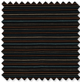
BOUNDARY Textured Linen Weave 6 Colours | 100% LI 🚗 ⬡ 📐