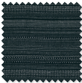
SCRIBE Hand Embroidered Linen Print 4 Colours | 90%LI, 10%PL ⬡ 📐