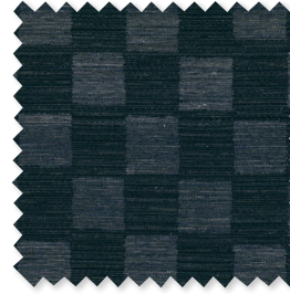
KENTE Textured Linen Weave 3 Colours | 75%LI, 9%VI, 8%CO, 7%PL 🚗 ⬡