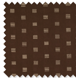
TEMPO Embroidered Linen 4 Colours | 68%LI, 32%CO 📐