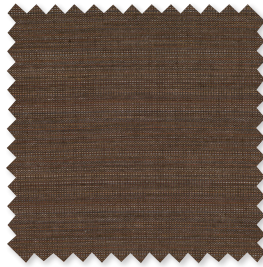
LATITUDE Textured Linen Weave 5 Colours | 98%LI, 1%PC, 1%PL 🚗 ⬡ 📐