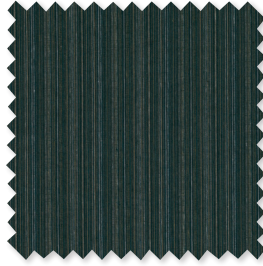
POLO Pure Linen Weave 7 Colours | 100% LI 🚗 ⬡