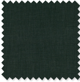
VELDT Linen Blend 11 Colours | 65%LI, 35%PA 🚗 ⬡ 📐

Highlights include Kente, a deliberately offset checkerboard design made using Mark Alexander's bespoke blended linen yarns; Scribe, a soft pure linen featuring accents of hand embroidery; and Sway a textural sheer that features an open leno weave that showcases innovative blended yarns.