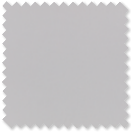
Wool Sheer 4 Colours | 100% WO ☒