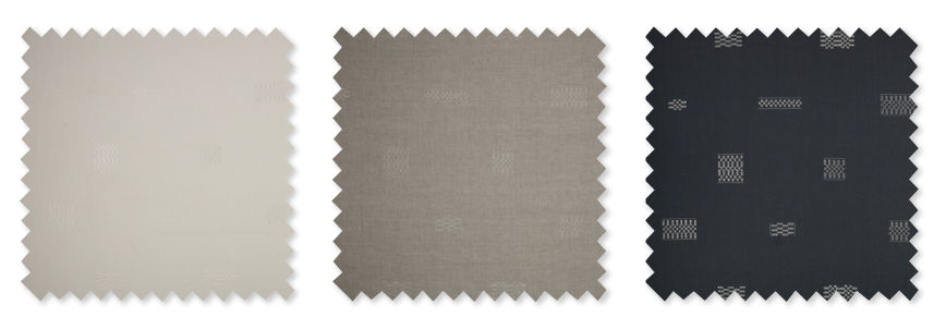
MOTIF Embroidered Linen | 3 Colours | ❖□