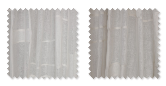
CENTO \label{eq:central_control} \mbox{Wide-Width Sheer} \ | \ 2 \ \mbox{Colours} \ | \ \square