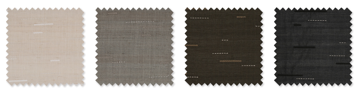
REFLECTION Embroidered Silk | 5 Colours | ❖□