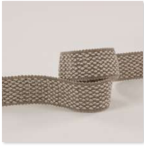
DECORER Braid 3 Colours