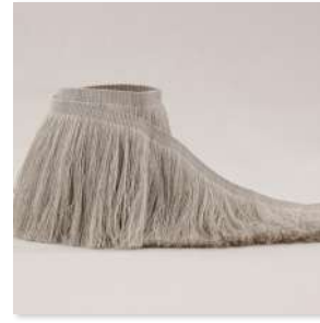
ELEGANTE Fringe 3 Colours