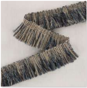
MELANGE Brush Fringe 7 Colours