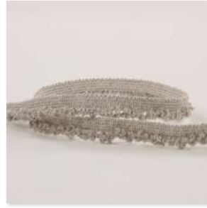
BOUCLE Fringe 4 Colours