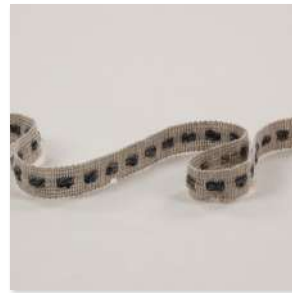
COUSU Braid 6 Colours