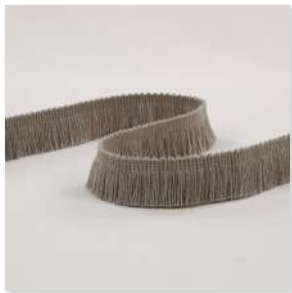
MAJESTE Brush Fringe 4 Colours