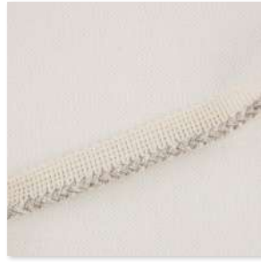
TRESSER Piping Cord 3 Colours