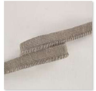
CORDE Cord 3 Colours