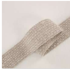
TISSAGE Braid 1 Colour