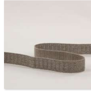
ORNER Braid 7 Colours