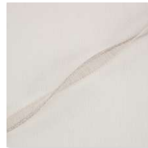
PETITE Cord 6 Colours