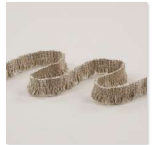
FRISSAGE Fringe 3 Colours