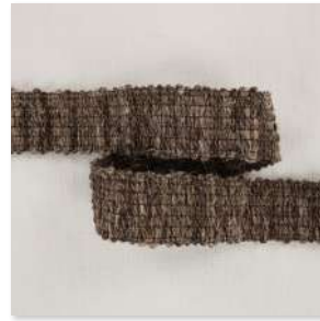
BORDURE Braid 7 Colours