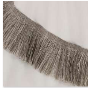
MARQUISE Fringe 2 Colours