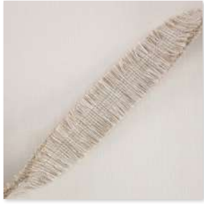
EMBELLIR Fringe 6 Colours