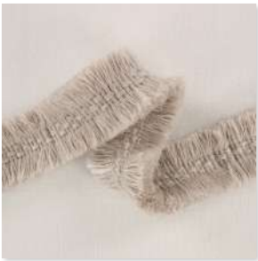
POMPONNER Double Edged Fringe 2 Colours