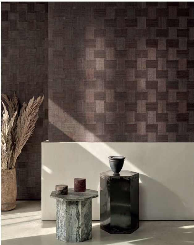
LATTICE MOSAIC | 4 Colours

Inspired by Berber weaves, this handwoven wallcovering is made of strands of hand coloured raffia yarns that give a beautifully textured contrast to the vertical stripe.