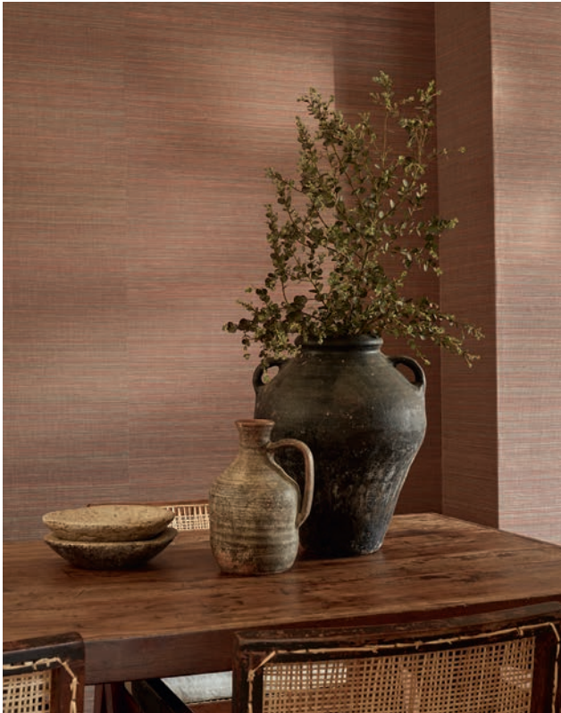
DUO ABACÁ | 6 Colours

Different colours of abacá are skilfully contrasted in a subtle and seemingly random way creating gentle movement in this shimmering grasscloth wallcovering.