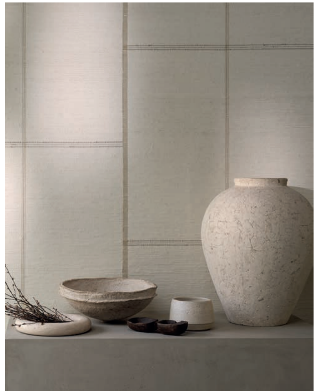
KOSHI | 4 Colours

Cut pieces of handwoven sisal are juxtaposed to create a stunning lattice effect that makes this mosaic wallcovering truly special.