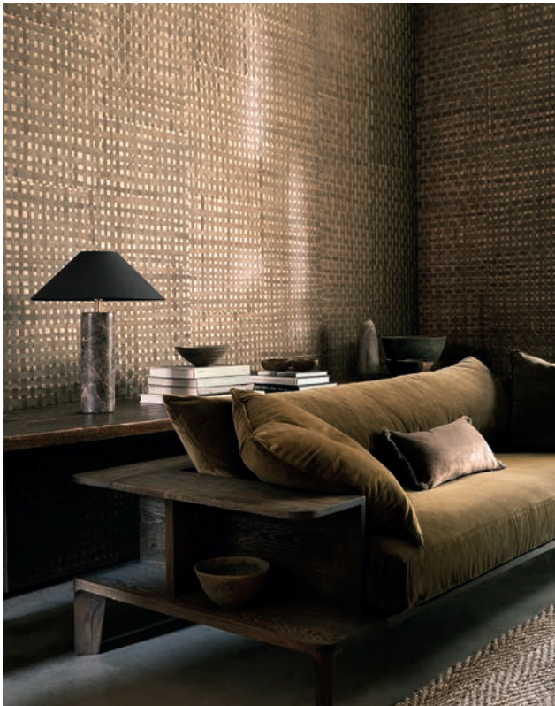
HYACINTH WEAVE | 4 Colours

A lattice of strands of handwoven water hyacinth has been mounted onto paper with a subtle sheen, creating a design of striking yet balanced contrast.