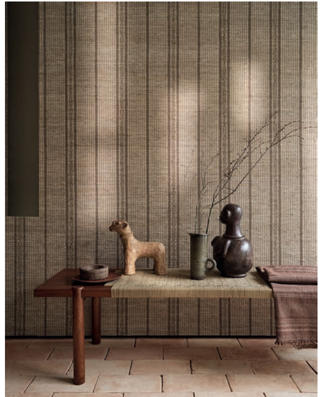
MEDINA | 3 Colours

A lattice of strands of handwoven water hyacinth has been mounted onto paper with a subtle sheen, creating a design of striking yet balanced contrast.