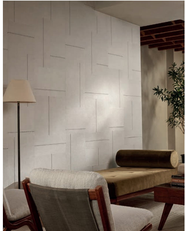
MERIDIAN | 4 Colours

Different colours of abacá are skilfully contrasted in a subtle and seemingly random way creating gentle movement in this shimmering grasscloth wallcovering.