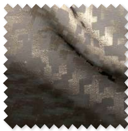
Minos Wide-Width Decorative Sheer 2 Colours