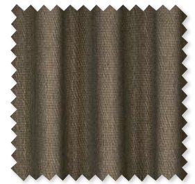
Neisha Wide-Width Semi-Sheer 2 Colours