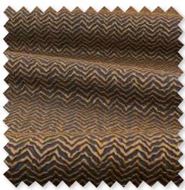
Musona Embroidery 3 Colours

Blending considered copper shades, subtle pinks and gold tones with jadeite hues, the palette provides a new perspective on contemporary opulence, flawlessly merging colour and texture.