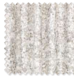
Siro Wide-Width Devoré Printed Sheer 1 Colour