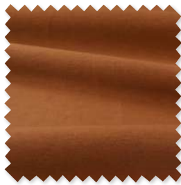
Miri Reversible Plain 4 Colours