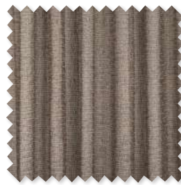
Mistra Wide-Width Decorative Sheer 4 Colours