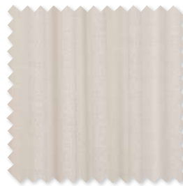
Etereo Wide-Width Decorative Sheer 3 Colours