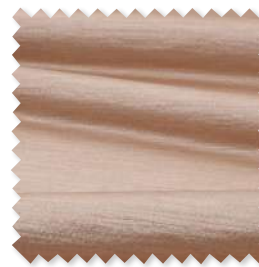
Sashi Satin Plain 7 Colours