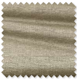
Hikari Semi-Plain 5 Colours