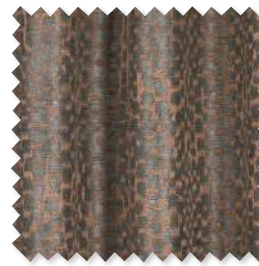
Zardozi Embroidered Semi-Sheer 1 Colour