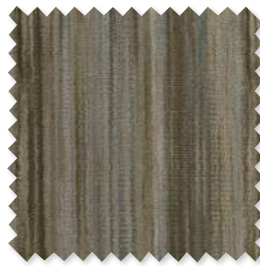
Iridos Lightweight Jacquard 4 Colours