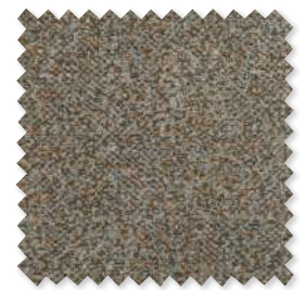
Arazzo Embroidered Jacquard Weave 4 Colours