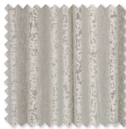
Isoku Wide-Width Devoré Sheer 3 Colours