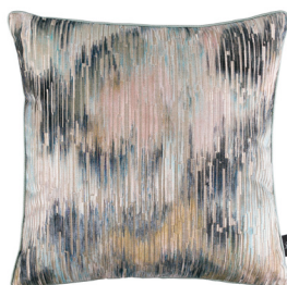
Hanawa Jacquard Blush

Face: Printed Jacquard Velvet Reverse: Plain Satin RBC122/02 50x50cm (19.75"x19.75")