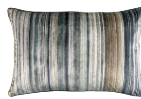
Tomoko Velvet Oxide

Face: Printed Velvet Reverse: Plain Satin RBC121/02 60x40cm (23.5"x15.75")