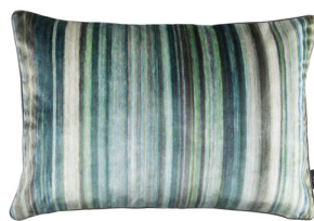
Tomoko Velvet Malachite

Face: Printed Jacquard Velvet Reverse: Plain Satin RBC122/01 50x50cm (19.75"x19.75")