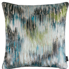
Hanawa Jacquard Jasper

Face: Textured Weave Reverse: Plain Satin RBC126/03 50x50cm (19.75"x19.75")