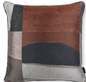
Tabala Mehndi Cover: Decorative Jacquard Weave RBC160/03 50x50cm (19.75"x19.75")