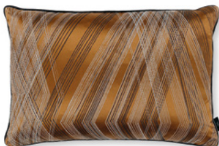
Imicu Copper Cover: Decorative Jacquard Weave RBC147/01 60x40cm (23.5"x15.75")