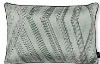
Imicu Mineral Cover: Decorative Jacquard Weave RBC147/03 60x40cm (23.5"x15.75")