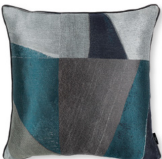
Tabala Teal Cover: Decorative Jacquard Weave RBC160/02 50x50cm (19.75"x19.75")