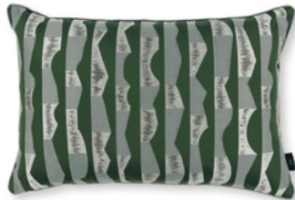
Ozari Kaitoke Cover: Embroidered Cotton Satin RBC146/02 60x40cm (23.5"x15.75")