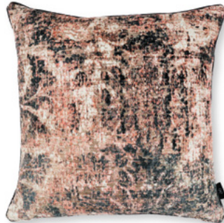
Jacinta Rhodonite Cover: Printed Jacquard Velvet RBC148/02 50x50cm (19.75"x19.75")