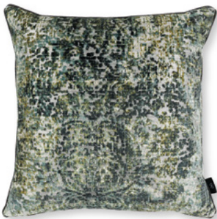
Jacinta Jasper Cover: Printed Jacquard Velvet RBC148/01 50x50cm (19.75"x19.75")