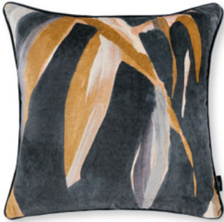
Makona Shadow Cover: Printed Velvet RBC143/01 50x50cm (19.75"x19.75")