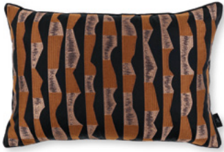
Ozari Mehndi Cover: Embroidered Cotton Satin RBC146/01 60x40cm (23.5"x15.75")