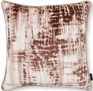
Jackson Rust Cover: Printed Velvet RBC150/01 50x50cm (19.75"x19.75")