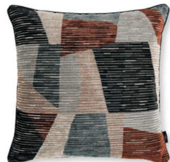
Tabala Velvet Syrah Cover: Printed Jacquard Velvet RBC144/03 50x50cm (19.75"x19.75")