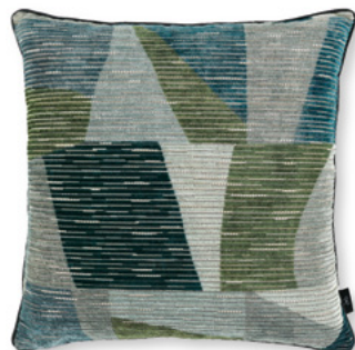
Tabala Velvet Wakame Cover: Printed Jacquard Velvet RBC144/02 50x50cm (19.75"x19.75")