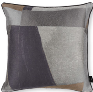
Tabala Indium Cover: Decorative Jacquard Weave RBC160/01 50x50cm (19.75"x19.75")