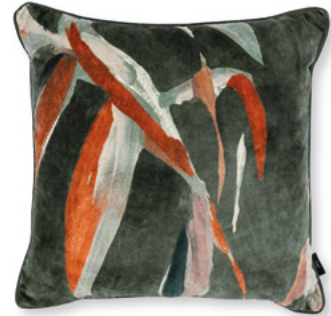
Makona Kaitoke Cover: Printed Velvet RBC143/03 50x50cm (19.75"x19.75")