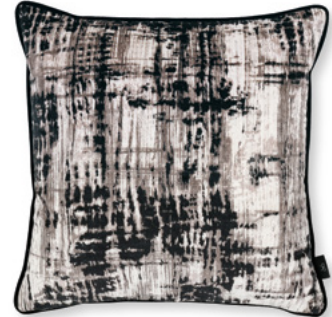
Jackson Charcoal Cover: Printed Velvet RBC150/03 50x50cm (19.75"x19.75")