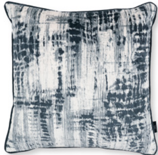
Jackson Shadow Cover: Printed Velvet RBC150/02 50x50cm (19.75"x19.75")