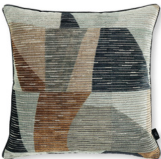
Tabala Velvet Oxide Cover: Printed Jacquard Velvet RBC144/01 50x50cm (19.75"x19.75")