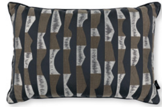
Ozari Carbon Cover: Embroidered Cotton Satin RBC146/03 60x40cm (23.5"x15.75")