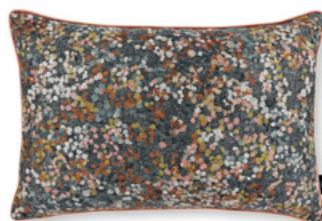
Naira Mehndi Cover: Embroidered Jacquard Weave RBC145/02 60x40cm (23.5"x15.75")