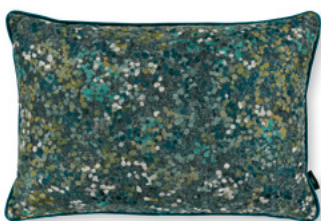
Naira Indium Cover: Embroidered Jacquard Weave RBC145/01 60x40cm (23.5"x15.75")