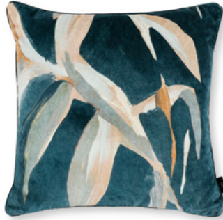
Makona Teal Cover: Printed Velvet RBC143/02 50x50cm (19.75"x19.75")