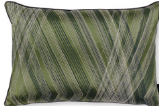
Imicu Wakame Cover: Decorative Jacquard Weave RBC147/02 60x40cm (23.5"x15.75")