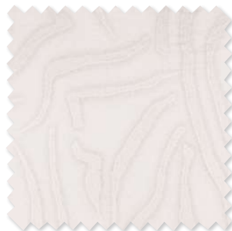
Contour Sheer Wide-Width Sheer 1 Colour