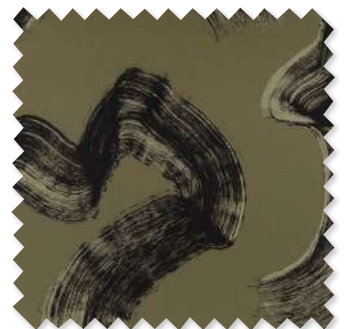
Tsauri Jacquard Weave 6 Colours