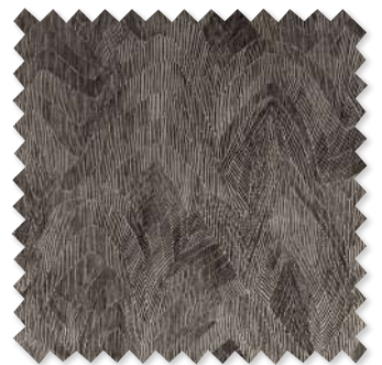
Onuma Decorative Flock Velvet 2 Colours