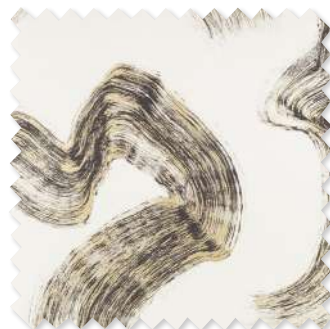
Tsauri Gilt Jacquard Weave 2 Colours