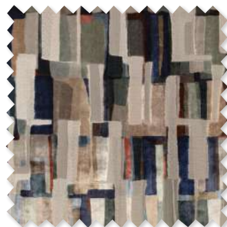
Quadrata Jacquard Velvet 3 Colours