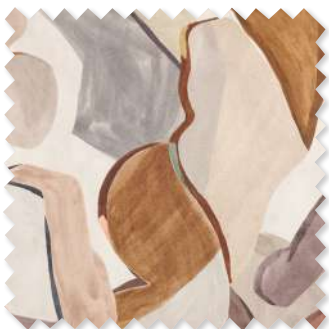
Figura Printed Linen 3 Colours