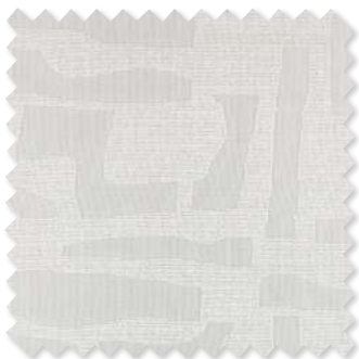
Makutu Wide-Width Bouclé Sheer 1 Colour