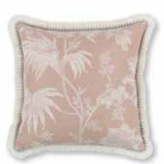
Chiya Jacquard Wild Rose Face: Jacquard Weave Reverse: Linen Blend RC754/03 50x50cm (19.5" x 19.5")