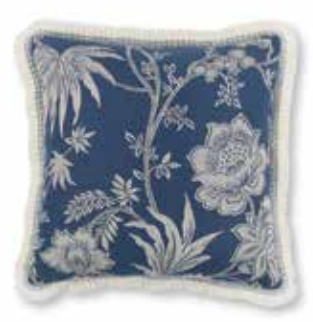
Chiya Jacquard Indigo Face: Jacquard Weave Reverse: Linen Blend RC754/02 50x50cm (19.5" x 19.5")