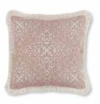
Aletta Sakura Face: Jacquard Weave Reverse: Textured Plain RC755/03 50x50cm (19.5" x 19.5")