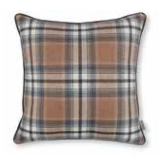
Elbury Ginger Face: Jacquard Weave Reverse: Textured Plain RC753/03 50x50cm (19.5" x 19.5")