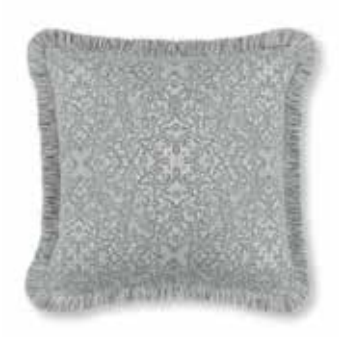
Aletta Cirrus Face: Jacquard Weave Reverse: Textured Plain RC755/02 50x50cm (19.5" x 19.5")