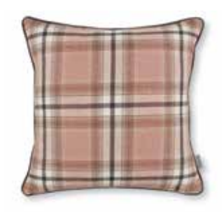
Elbury Sakura Face: Jacquard Weave Reverse: Textured Plain RC753/04 50x50cm (19.5" x 19.5")