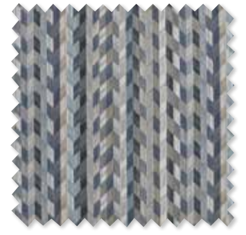
ETTO Jacquard Weave 5 Colours