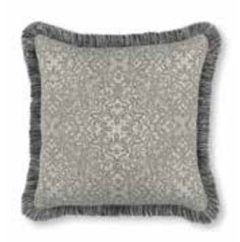
Aletta Pewter Face: Jacquard Weave Reverse: Textured Plain RC755/01 50x50cm (19.5" x 19.5")