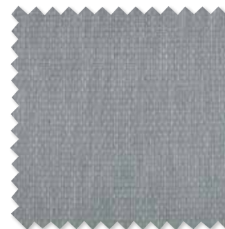
COLBIE Jacquard Weave 8 Colours \square \diamondsuit \square