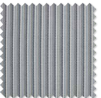
ALBA Jacquard Weave 5 Colours