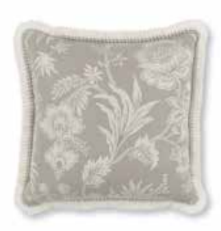
Chiya Jacquard Silver Face: Jacquard Weave Reverse: Linen Blend RC754/01 50x50cm (19.5" x 19.5")