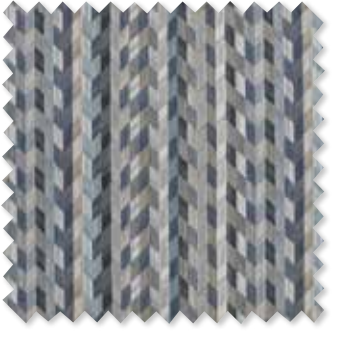
ELBURY Jacquard Weave \square \diamondsuit \square 7 Colours