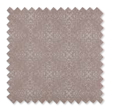
ALETTA Jacquard Weave 4 Colours \square \diamondsuit \square