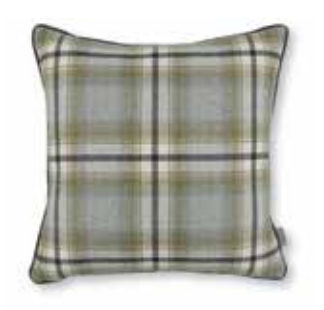
Elbury Silver Blue Face: Jacquard Weave Reverse: Textured Plain RC753/01 50x50cm (19.5" x 19.5")