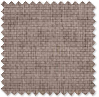
Jacquard Weave 4 Colours