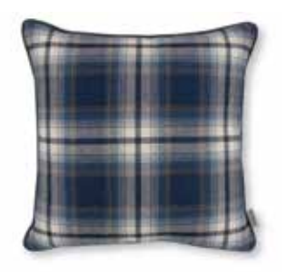
Elbury Indigo Face: Jacquard Weave Reverse: Textured Plain RC753/02 50x50cm (19.5" x 19.5")