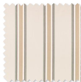
Elson Cotton Blend Stripe 5 Colours