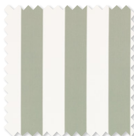
Aron Cotton Stripe 9 Colours