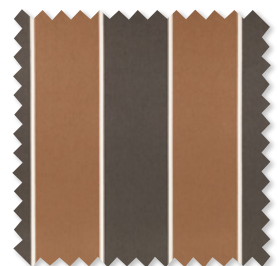
Arbury Cotton Blend Stripe 6 Colours