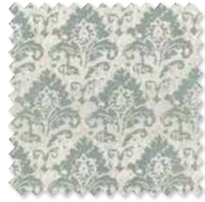
ADACHI Jacquard Weave 6 Colours