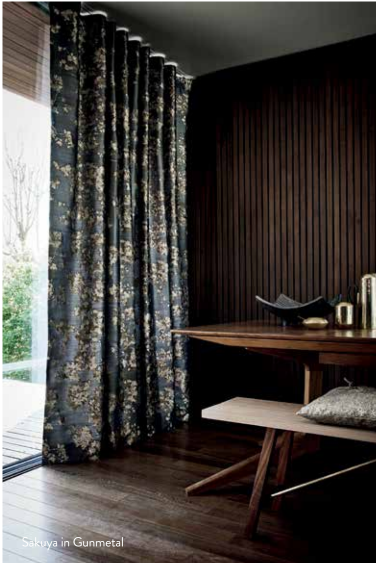
Sakuya in Gunmetal