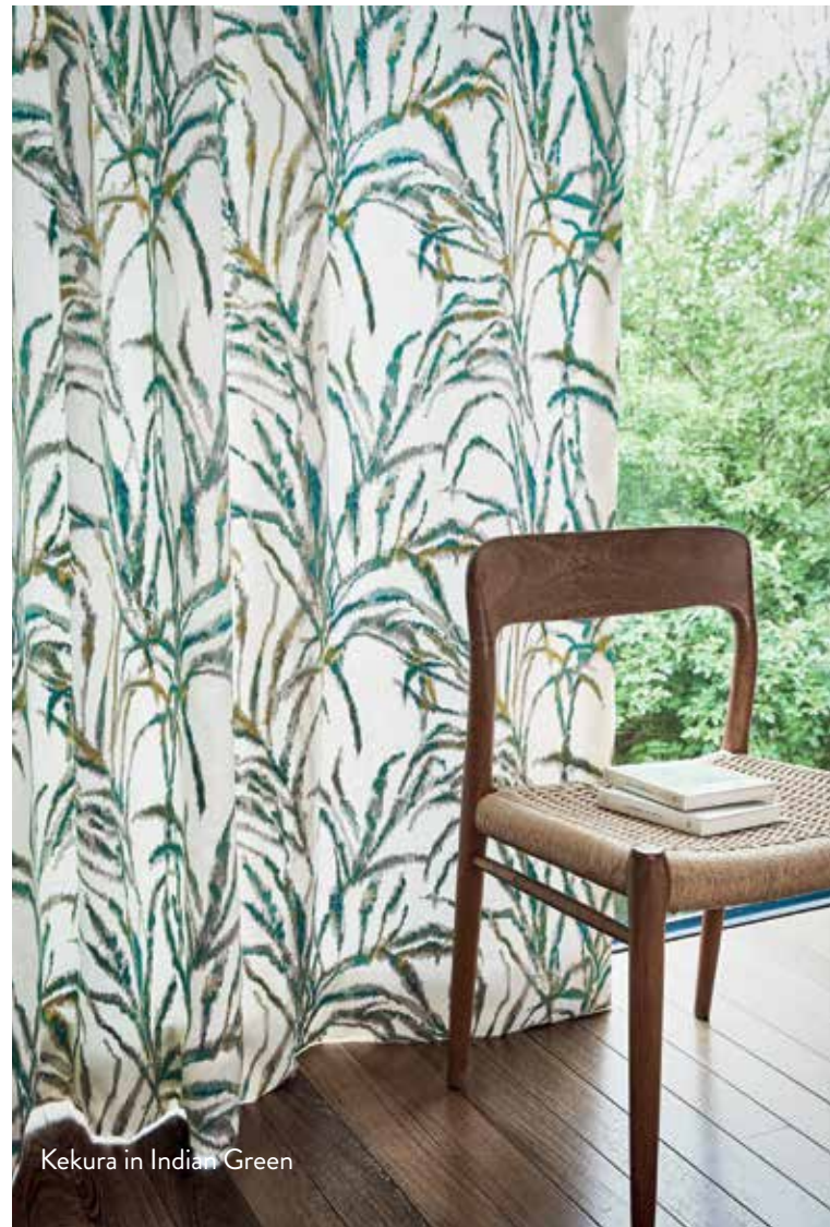
Kekura in Indian Green