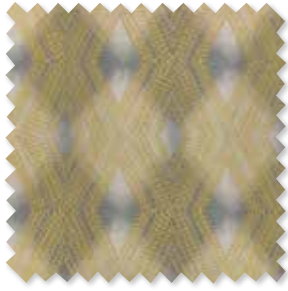
HITO Embroidered Jacquard 4 Colours