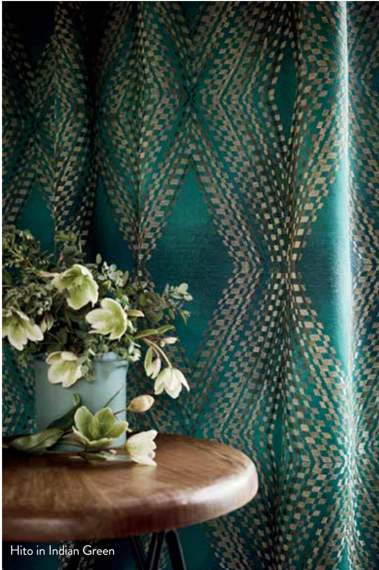
Hito in Indian Green