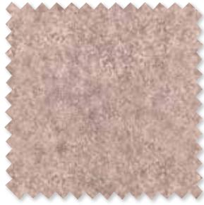
NYIRI Jacquard Weave 6 Colours