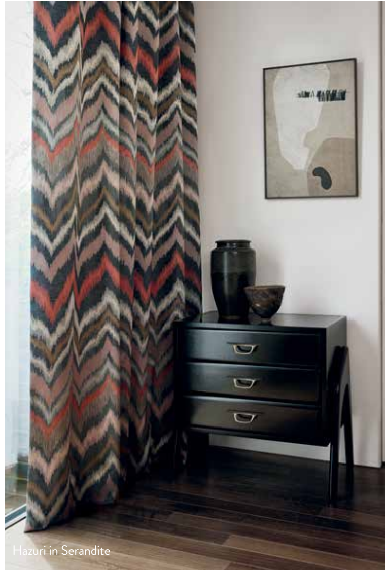
Hazuri in Serandite

“Contemporary and artistic, the Itami collection offers a variety of drapery possibilities to suit any interior, from the country home to the city apartment.”