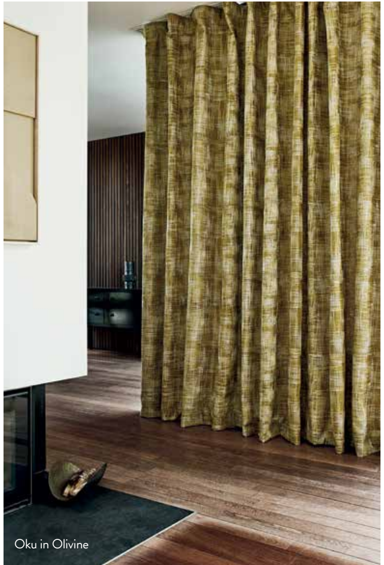
Oku in Olivine