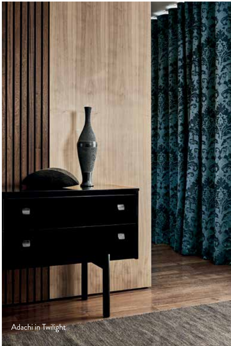
Adachi in Twilight