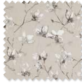
SAPHIRA Embroidered Linen 4 Colours