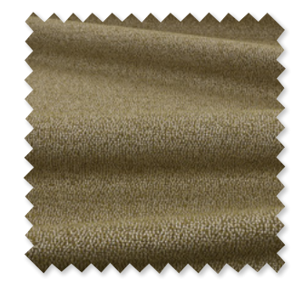
Olavi Textured Weave 11 Colours