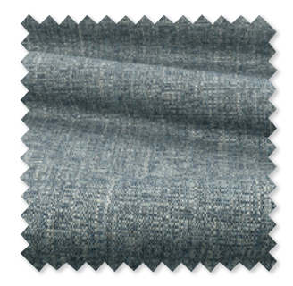
Kelby Textured Weave 14 Colours