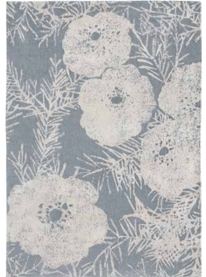
Steel Blue RG8742