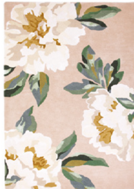
RG2049 Wild Rose