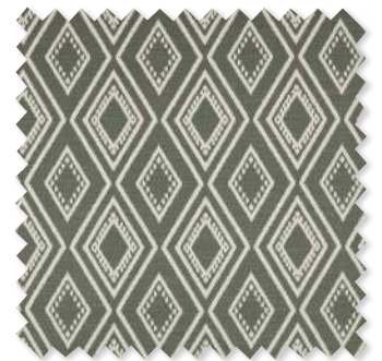
Toulin Printed Linara 6 Colours