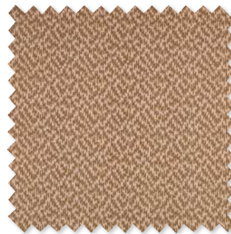
Isala Printed Linara 6 Colours