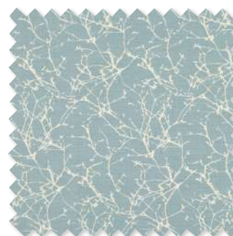
Acacia Printed Linara 6 Colours