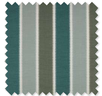
Odina Printed Linara 4 Colours