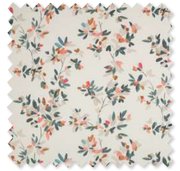
Elsi Printed Linara 4 Colours