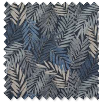
Samora Printed Linara 5 Colours