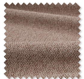
Aikana Textured Boucle Weave 6 Colours