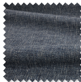
Sula Semi-Plain Weave 11 Colours