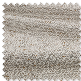
Zolani Textured Weave 5 Colours