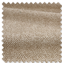
Okeyo Textured Weave 4 Colours