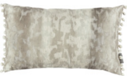
Laru Granite VNC3534/02 50cm x 30cm / 19.75" x 11.75"