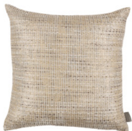
Caldera Marble VNC3533/03 50cm x 50cm / 19.75" x 19.75"