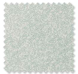
Tottori | 6 Colours Jacquard Weave