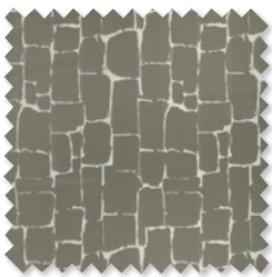
Roca | 7 Colours Jacquard Satin Weave