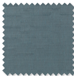
Basalt | 5 Colours Wide-Width Semi-Sheer