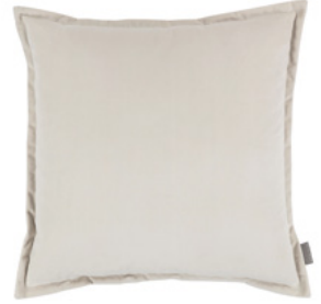
Rio Seal VNC3539/10 55cm x 55cm / 21.75" x 21.75"