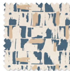
Lydia | 5 Colours Foil Print