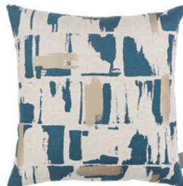
Lydia Indigo VNC3541/04 50cm x 50cm / 19.75" x 19.75"