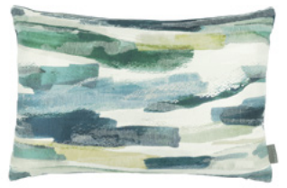
Danxia Emerald VNC3531/03 60cm x 40cm / 23.5" x 15.75"