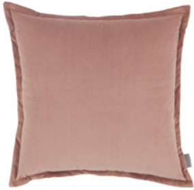
Rio Lotus VNC3539/31 55cm x 55cm / 21.75" x 21.75"