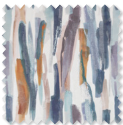
Danxia | 4 Colours Wide-Width Printed Jacquard Weave