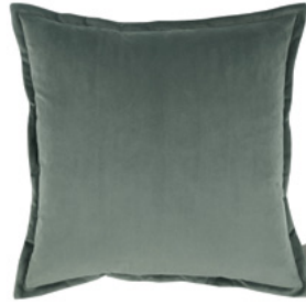
Rio Agave VNC3539/45 55cm x 55cm / 21.75" x 21.75"