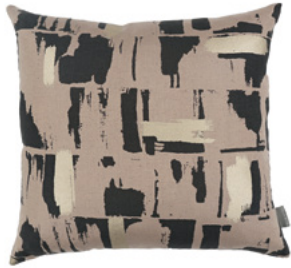
Lydia Lotus VNC3541/01 50cm x 50cm / 19.75" x 19.75"