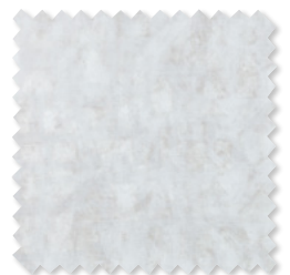
Tanah | 2 Colours Printed Jacquard Weave