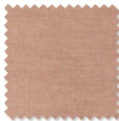
Goldstone | 9 Colours Wide-Width Semi-Sheer