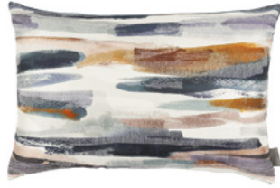
Danxia Sundown VNC3531/01 60cm x 40cm / 23.5" x 15.75"