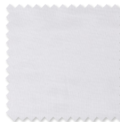
Quartzite | 6 Colours Wide-Width Sheer