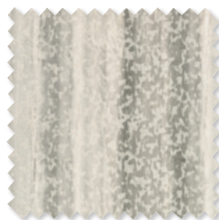
Laru | 3 Colours Wide-Width Jacquard Weave