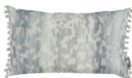
Laru Agate VNC3534/03 50cm x 30cm / 19.75" x 11.75"