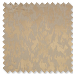
Galena | 5 Colours Jacquard Weave