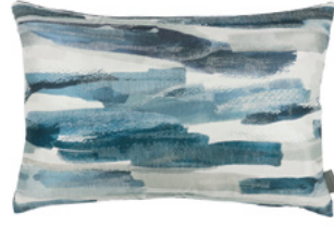
Danxia Indigo VNC3531/02 60cm x 40cm / 23.5" x 15.75"