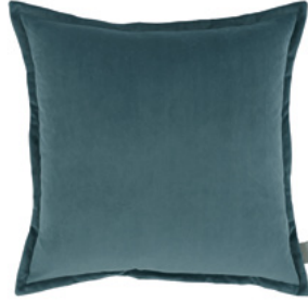
Rio Rain VNC3539/37 55cm x 55cm / 21.75" x 21.75"