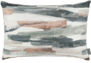
Danxia Lotus VNC3531/04 60cm x 40cm / 23.5" x 15.75"