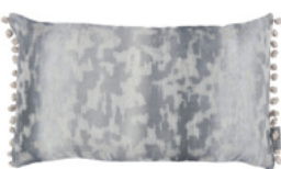
Laru Thunder VNC3534/01 50cm x 30cm / 19.75" x 11.75"