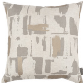
Lydia Pearl VNC3541/03 50cm x 50cm / 19.75" x 19.75"