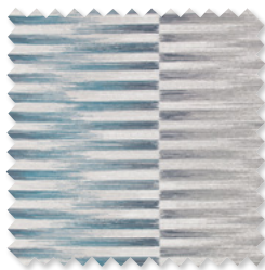
Mesa | 3 Colours Jacquard Weave