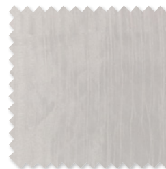
Keshi | 5 Colours Wide-Width Sheer