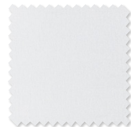
Mica | 2 Colours Wide-Width Sheer