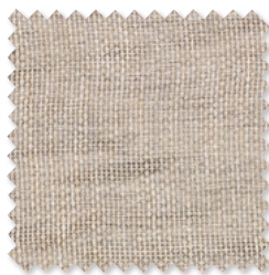
Morro | 4 Colours Wide-Width Sheer