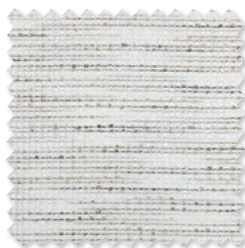
Caldera | 3 Colours Foil Printed Jacquard Weave