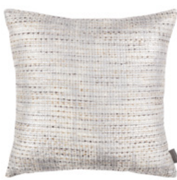
Caldera Pearl VNC3533/02 50cm x 50cm / 19.75" x 19.75"