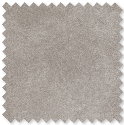
Estella | 14 Colours