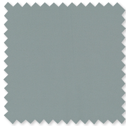
Alya | 9 Colours