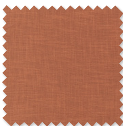
Erice | 14 Colours Recycled Wide-Width Sheer