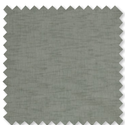
Noto | 15 Colours Recycled Wide-Width Sheer