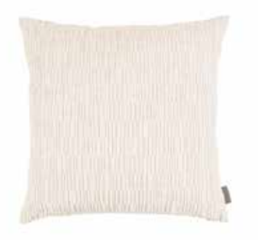
Perrie Ice VNC3482/03 55cm x 55cm / 21.75" x 21.75"