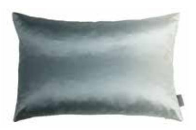
Kasian Gradient Rain VNC3478/02 50cm x 30cm / 19.75" x 11.75"