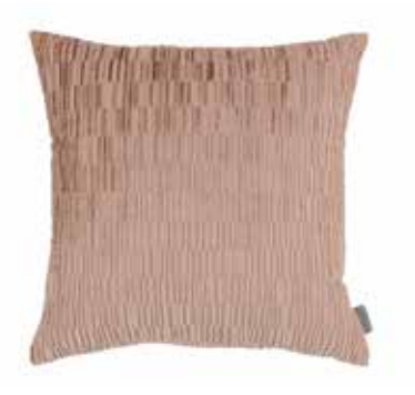
Perrie Conch VNC3482/02 55cm x 55cm / 21.75" x 21.75"