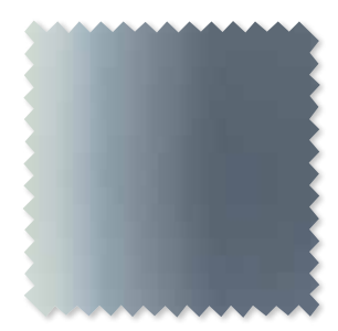
Kasian Gradient | 3 Colours Textured Satin ⊕ □