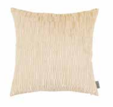
Perrie Clay VNC3482/01 55cm x 55cm / 21.75" x 21.75"

Face: Decorative Velvet | Reverse: Textured Satin