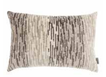
Cally Driftwood VNC3484/03 40cm x 40cm / 15.75" x 15.75"