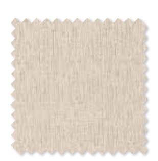
Ilia | 14 Colours Jacquard Weave ◆□