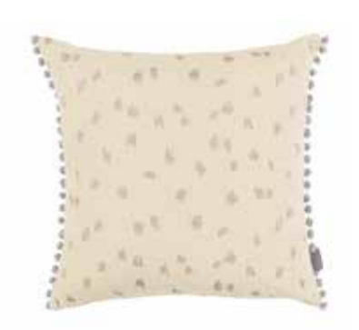
Elswyth Bone VNC3480/03 60cm x 60cm /23.5" x 23.5"

Face: Decorative Velvet | Reverse: Textured Satin