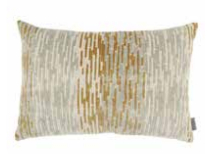
Cally Desert VNC3484/02 40cm x 40cm / 15.75" x 15.75"