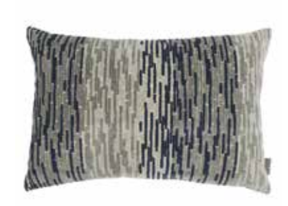
Cally Tide VNC3484/04 40cm x 40cm / 15.75" x 15.75"