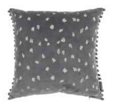
Elswyth Narwhal VNC3480/01 60cm x 60cm /23.5" x 23.5"