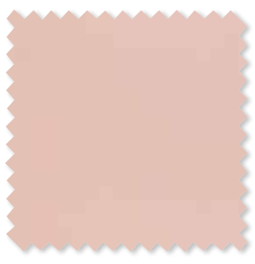
Kasian | 33 Colours Textured Satin ❖□

The range encompasses the popular Kasian, a supple, plain satin with a unique touch reminiscent of hammered metal, and Ilia, a softly flowing weave with an irregular linear pattern and fine texture. Completing the collection is Kasian Gradient, which sees the Kasian satin printed to feature an on-trend ombre that gently moves in strength of tone from light to dark across the cloth.