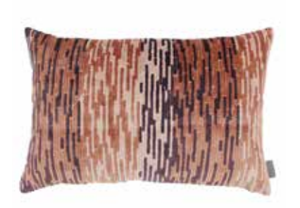
Cally Sundown VNC3484/01 40cm x 40cm / 15.75" x 15.75"