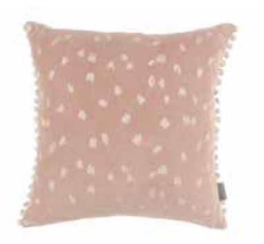
Elswyth Conch VNC3480/02 60cm x 60cm /23.5" x 23.5"