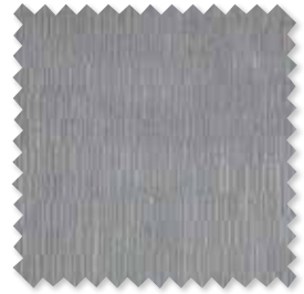
Perrie | 5 Colours Decorative Velvet ◆□