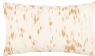
Espy Ochre VNC3512/05 50cm x 30cm / 19.75" x 11.75"