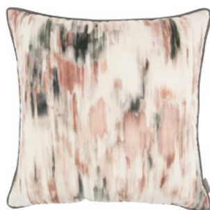
Alora Tuscan VNC3514/05 60cm x 60cm / 23.5" x 23.5"