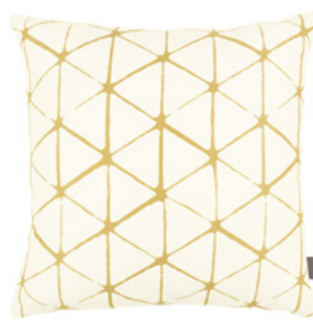
Haldon Ochre VNC3152/08 55cm x 55cm / 21.75" x 21.75"