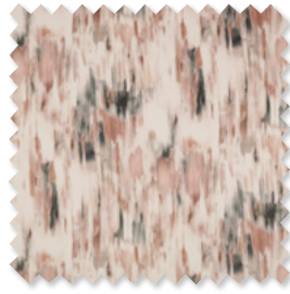
Alora | 5 Colours Printed Velvet