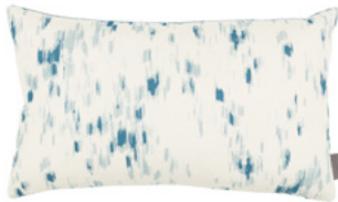
Espy Sapphire VNC3512/01 50cm x 30cm / 19.75" x 11.75"