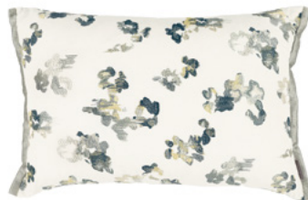
Aster Deco VNC3509/02 60cm x 40cm / 23.5" x 15.75"