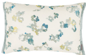
Aster Laguna VNC3509/04 60cm x 40cm / 23.5" x 15.75"