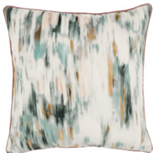
Alora Deco VNC3514/01 60cm x 60cm / 23.5" x 23.5"