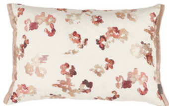
Aster Jewel VNC3509/05 60cm x 40cm / 23.5" x 15.75"