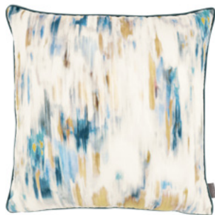
Alora Laguna VNC3514/04 60cm x 60cm / 23.5" x 23.5"