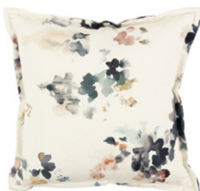
Reverie Deco VNC3511/03 55cm x 55cm / 21.75" x 21.75"