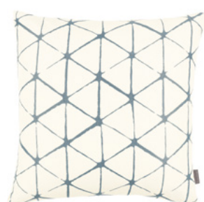
Haldon Chambray VNC3152/04 55cm x 55cm / 21.75" x 21.75"