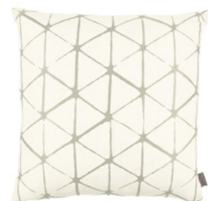
Haldon Chalk/Cinder VNC3152/05 55cm x 55cm / 21.75" x 21.75"