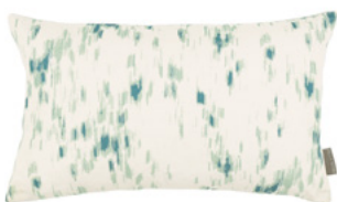
Espy Emerald VNC3512/03 50cm x 30cm / 19.75" x 11.75"