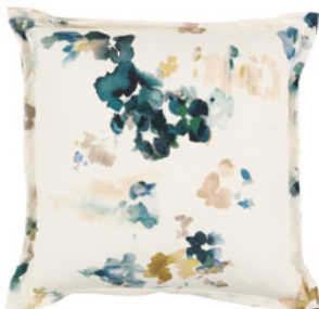
Reverie Laguna VNC3511/05 55cm x 55cm / 21.75" x 21.75"