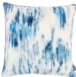
Alora Sapphire VNC3514/03 60cm x 60cm / 23.5" x 23.5"