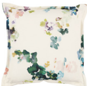
Reverie Emerald VNC3511/02 55cm x 55cm / 21.75" x 21.75"