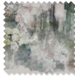
Wander | 1 Colour Printed Wide-Width Sheer