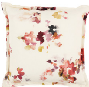
Reverie Jewel VNC3511/04 55cm x 55cm / 21.75" x 21.75"