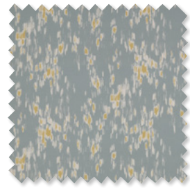
Espy | 5 Colours Printed Cotton Linen