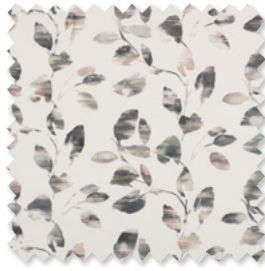
Arwen | 4 Colours Printed Cotton