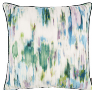
Alora Emerald VNC3514/02 60cm x 60cm / 23.5" x 23.5"