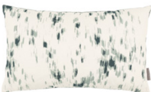
Espy Carbon VNC3512/02 50cm x 30cm / 19.75" x 11.75"