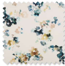
Reverie | 5 Colours Printed Cotton