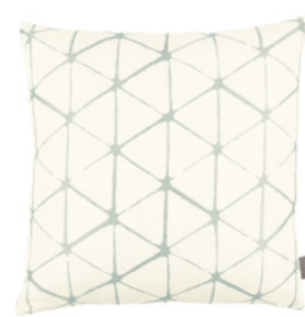
Haldon Eggshell VNC3152/02 55cm x 55cm / 21.75" x 21.75"