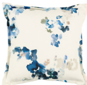
Reverie Sapphire VNC3511/01 55cm x 55cm / 21.75" x 21.75"