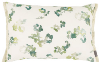
Aster Emerald VNC3509/03 60cm x 40cm / 23.5" x 15.75"