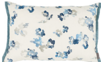
Aster Sapphire VNC3509/01 60cm x 40cm / 23.5" x 15.75"