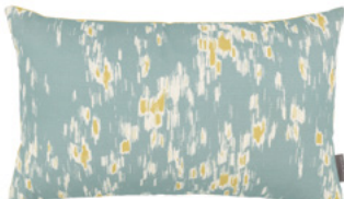
Espy Laguna VNC3512/04 50cm x 30cm / 19.75" x 11.75"