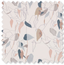
Liana | 5 Colours Printed Cotton