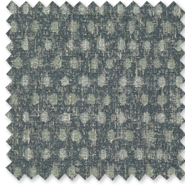
Bevan | 3 Colours Decorative Weave