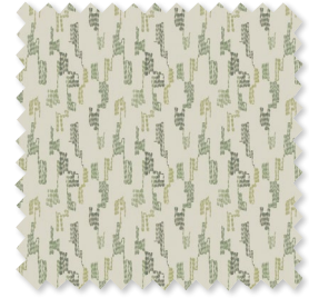
Broderie | 5 Colours Printed Linen Cotton