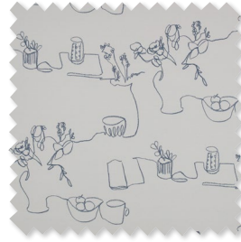
Tabletop | 5 Colours Printed Linen Cotton