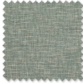
Innes | 9 Colours Decorative Weave