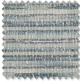
Bayes | 7 Colours Decorative Weave

Presenting a homely collection of weaves featuring organic shapes and pleasing textures, together with an abstract design inspired by a still life composition of shapely bottles and oversized vessels. These six tactile, heavily textured weaves are suitable for upholstery and drapes and presented in a charming colour palette that creates a sense of calm.