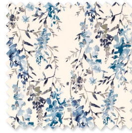
Hana | 5 Colours Printed Cotton