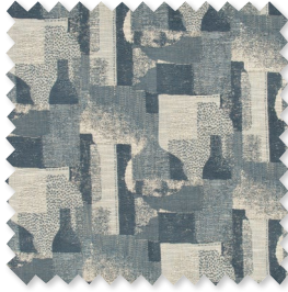
Still Life | 5 Colours Decorative Weave