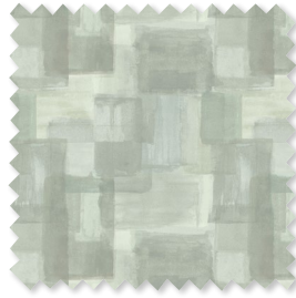
Patchwork | 3 Colours Printed Linen Cotton