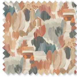
Potting Shed | 5 Colours Printed Linen Cotton