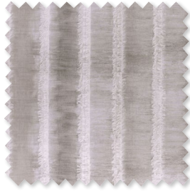
Fenery | 2 Colours Wide-Width Print

Still Life is influenced by objects and foliage recreated as painterly forms and sketches. A flowing line drawing of a looping tabletop scene sits with a print of a humble potting shed nestled between rows of vegetables rendered in energetic brush strokes. These expressive designs are balanced by an entwining wisteria and a trailing leaf design. The organic natural feel of the collection is enhanced further by a soft colour washed print with an intriguing feathery fringe and a rustic style pattern inspired by a simple study of hand stitching.