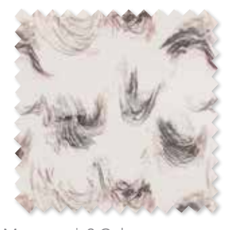
Murmurs | 3 Colours Printed Cotton Satin ♦ 🖸