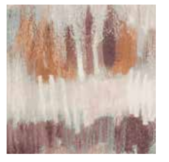
Field | 3 Colours