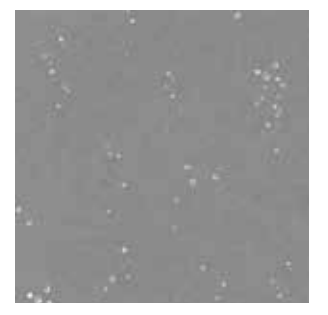
Ditto | 4 Colours