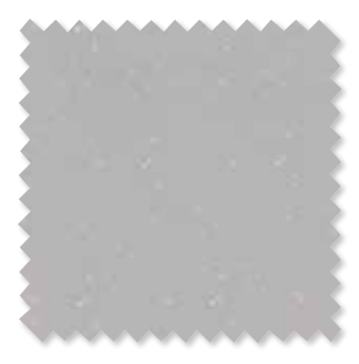
Ditto | 3 Colours Reversible Satin Weave ♦ 🖾