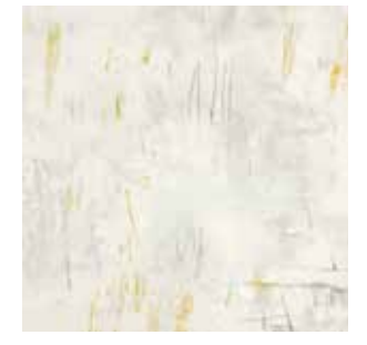
Sgraffito | 3 Colours