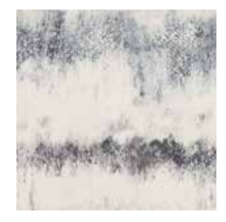
Ombre | 3 Colours