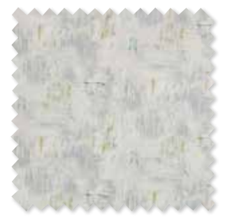
Sgraffito | 3 Colours Printed Satin ♦ 🖸