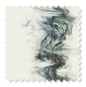
Drifting | 1 Colour Wide-Width Velvet �⊡