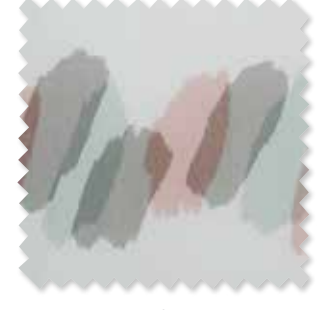
Fusion | 2 Colours Wide-Width Semi-Sheer �⊠