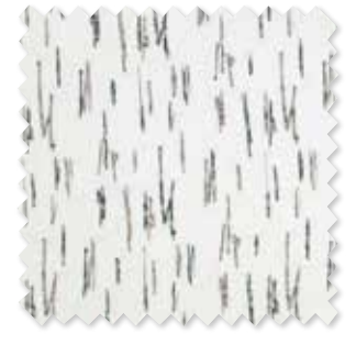
Staccato | 2 Colours Embroidery �⊠