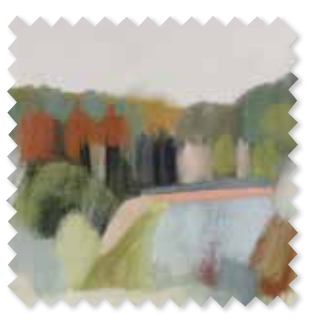
Welbeck | 2 Colours Wide-Width Semi-Sheer Print ♦ □