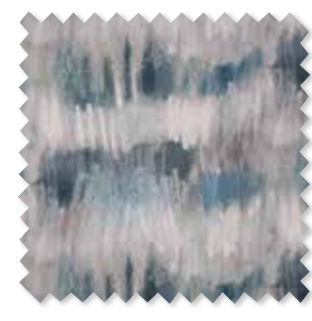
Field | 3 Colours Printed Cotton ⊕�₽