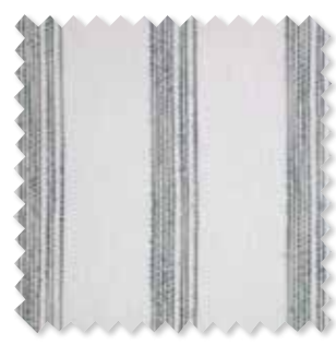
Harley | 3 Colours Wide-Width Sheer ⊖♦₪