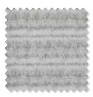
Ombre | 2 Colours Wide-Width Printed Jacquard Weave ♦ 🖾