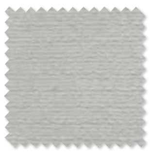
Alumina | 2 Colours Wide-Width Sheer ♦⊠