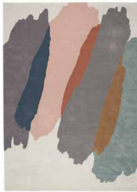
Fusion Sienna RG2034