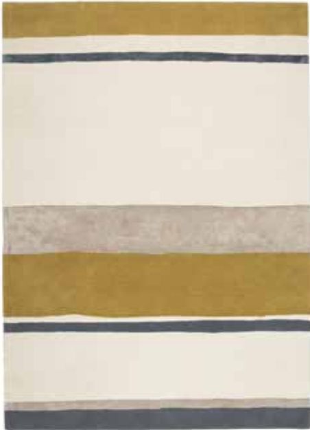
Harley Ochre RG2035

Introduce warmth, luxury and statement design with a hand tufted rug inspired by Kyra's visionary ceramics. These striking hand tufted rugs have a deep, luxurious pile that is comfortable and sumptuous underfoot.