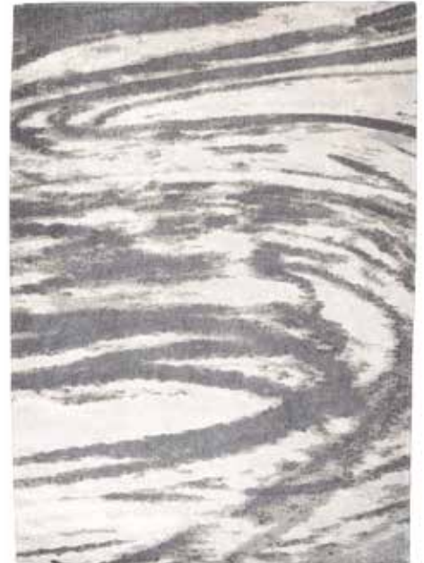
Drifting Silica RG9194