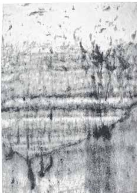
Glaze Carbon RG9185