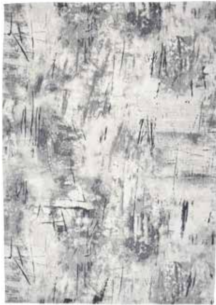
Sgraffito Carbon RG9186