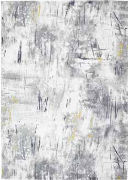
Sgraffito Ochre RG9187

This range of flat weave rugs encapsulate the textural interest, dynamism and spirit of Kyra's ceramic pieces. Woven with soft chenille, the rugs incorporate subtle variations of colour and appealing textures.