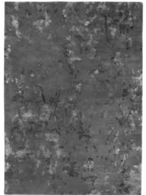
Alumina Carbon RG2037