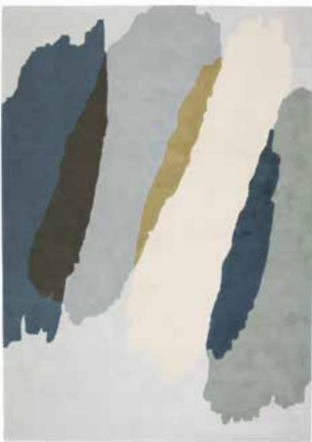
Fusion Celadon RG2033