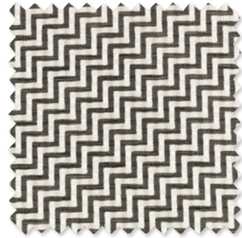
ladder Chevron Weave 4 colours 🚗 ⬡ 🏠