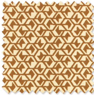
hex Bouclé Pocket Weave 4 Colours 🚗 ⬡