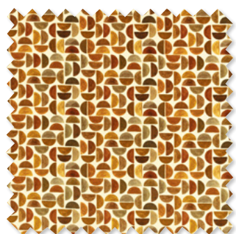
par Printed Cotton Velvet 2 Colours 🚗 ⬡ 🏠