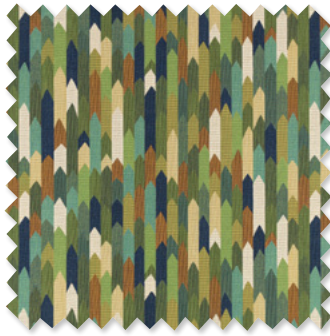
arraz Tapestry Jacquard Weave 3 Colours 🚗 ⬡