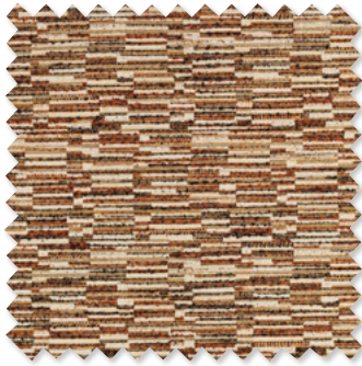
jenga Bouclé 5 Colours 🚗 ⬡ 🏠