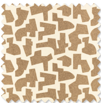
jigsaw Embroidered Cotton 3 Colours 🚗 ⬡ 🏠