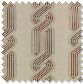
ludo Embroidery 2 Colours 🚗 ⬡ 🏠