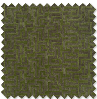
labyrinth Embroidered Cotton Velvet 4 Colours 🚗 ⬡