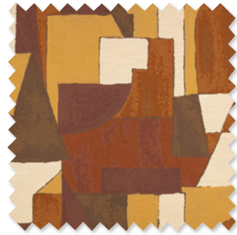
cubilete Tapestry Jacquard Weave 2 Colours 🚗 ⬡ 🏠