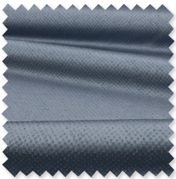
ROXY Semi-Plain Jacquard Weave 9 Colours ◆

An embossed velvet, a faux silk and a calendared chenille, as well as a melange velvet and a decorative weave make up this collection of the fantastic five. Rich in colour; shades of Hunting green, Calypso blue and Brunello red create strong statements, not forgetting the importance of classic neutrals.