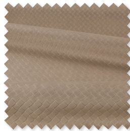
CACHACA Embossed Velvet 10 Colours ◆