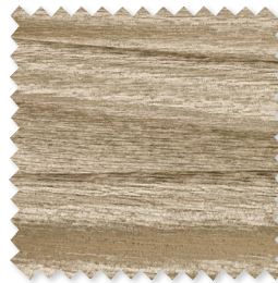
MERCER Chenille 10 Colours ◆