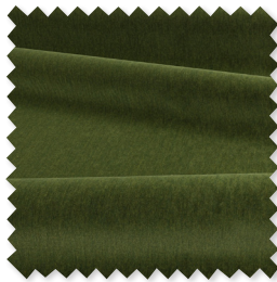
LENNY Velvet 9 Colours ◆