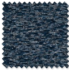
COSSURA Outdoor Weave 4 Colours ☞◇