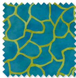
SPLASH Outdoor Print 3 Colours ☞◇☞