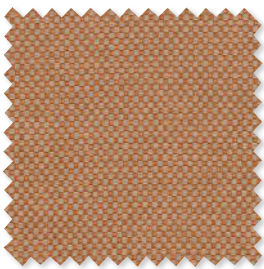
BUALE Outdoor Weave 6 Colours ☞◇