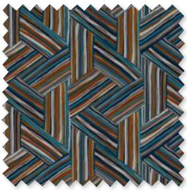
HARI Outdoor Print 4 Colours ☞◇