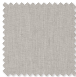
FLAMANDS Wide width Outdoor Semi-sheer 1 Colour ◇☞