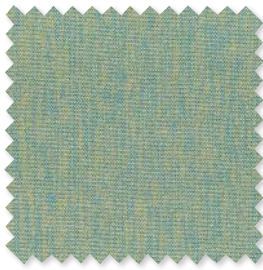
ZAMNA Outdoor Weave 6 Colours ☞◇