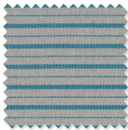
GIANNI Outdoor Weave 6 Colours ☞◇