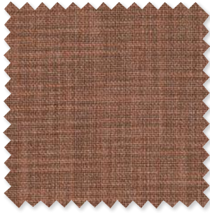
MARTINGANA Semi-plain Weave 8 Colours ☞ ⬠ ☞