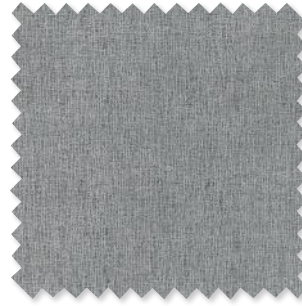
CONCHIGLIA Textured Chenille 5 Colours ☞ ⬠ ☞