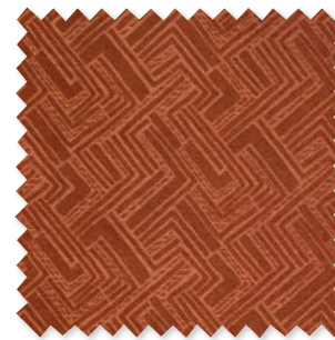
SATARIA Jacquard Chenille 7 Colours ☞ ⬠ ☞