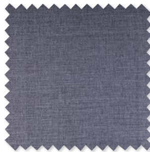
LOQUITO Foiled Linen Blend 8 Colours ☞ ⬠ ☞